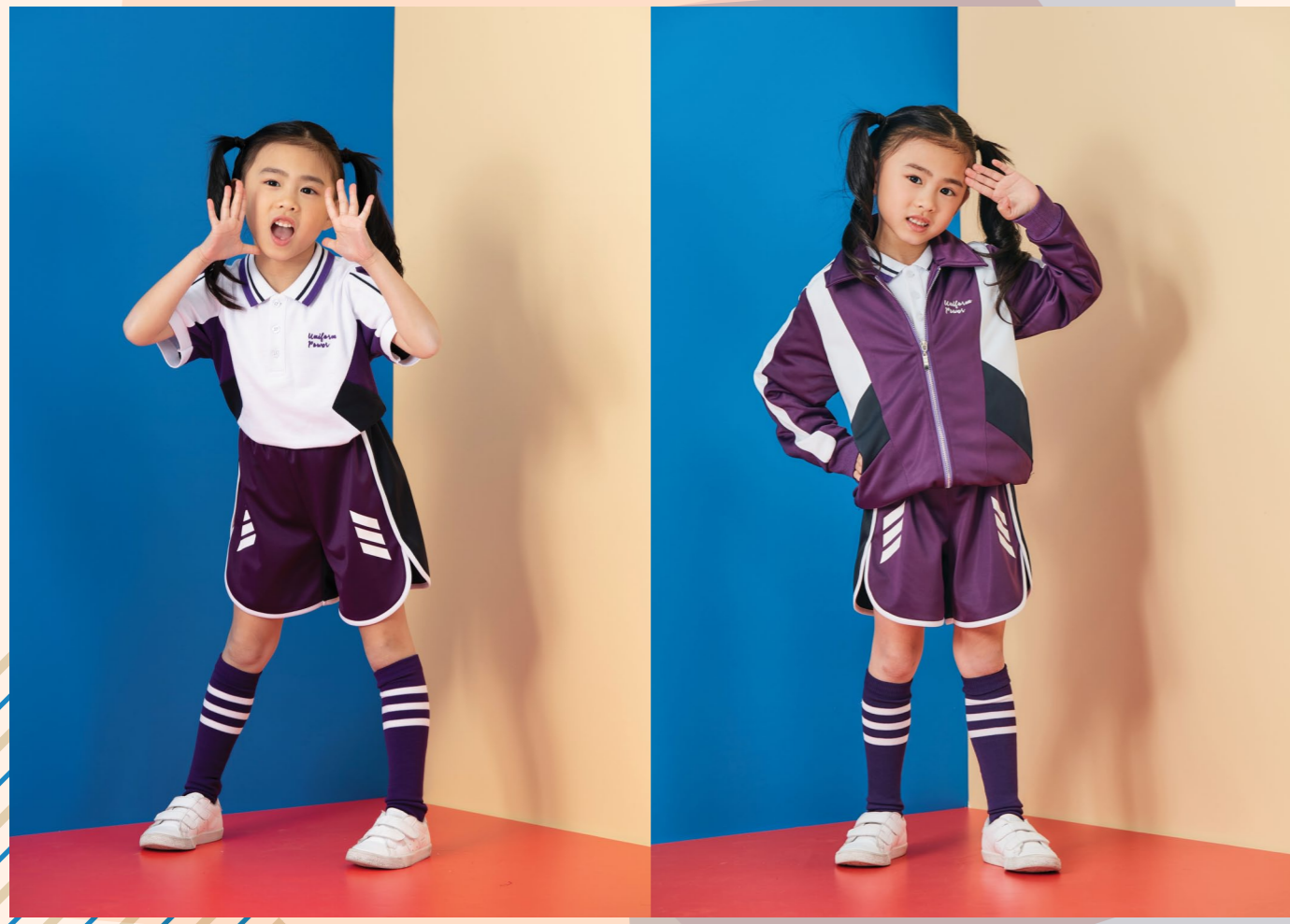
Geometric mixed colors water repellent sporty suit