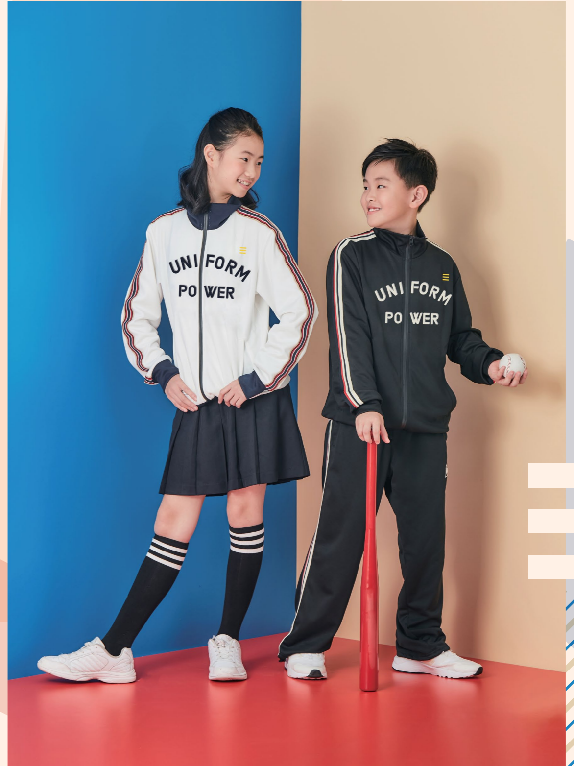
學校LOGO撞色鑲邊運動套裝 School Logo with mixed colors trimming sporty suit