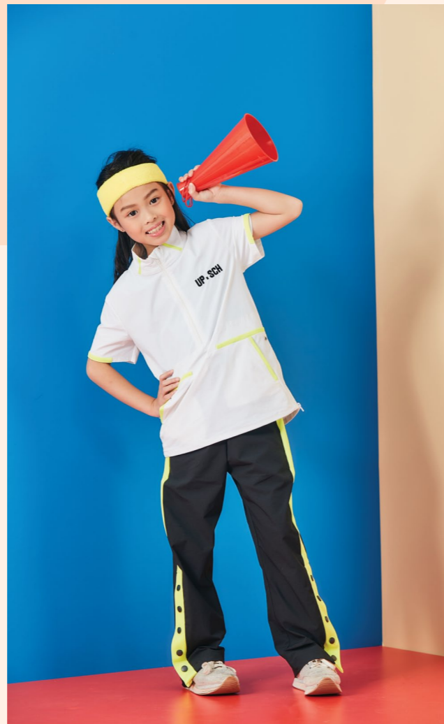
短袖防風尼龍薄外套 Short sleeves Nylon windbreaker