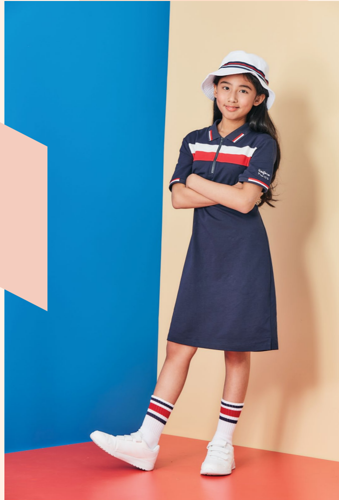
撞色鑲邊POLO領連衣裙 Piping edge mixed colors one piece dress with polo collar